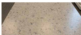
Terrazo ARMADILLO with LABFENDER 240