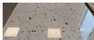
Terrazo JUNEAU Flooded