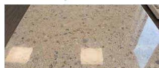
Terrazo ARMADILLO Flooded