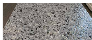
Signature 1/4" NIGHTFALL