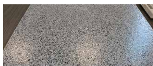
Signature 1/16" NIGHTFALL with LABFENDER