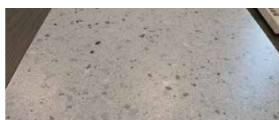
Terrazo JUNEAU with LABFENDER 240